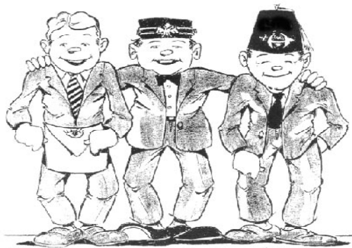
Drawing by our late Brother Gus Zebler, 32°